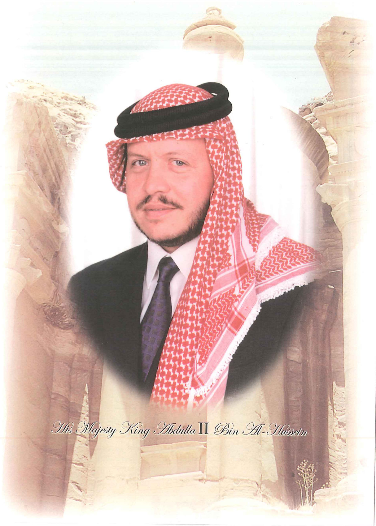
His Majesty King Abdulla II Bin Al-Hussein